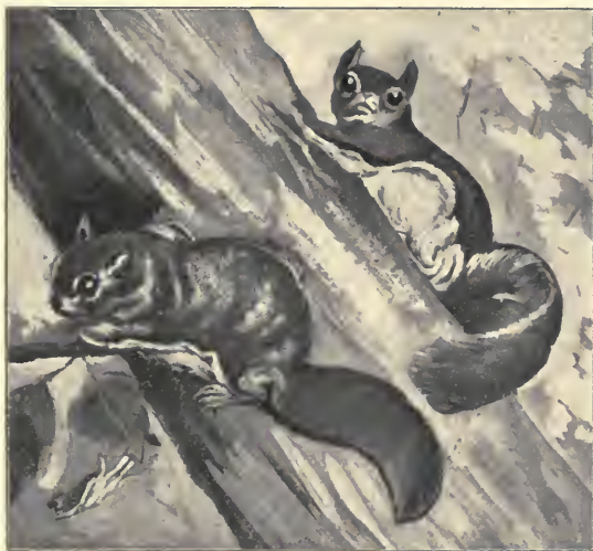
FIG. XXX. SCIUROPTERUS VOLANS. COMMON FLYING SQUIRREL.